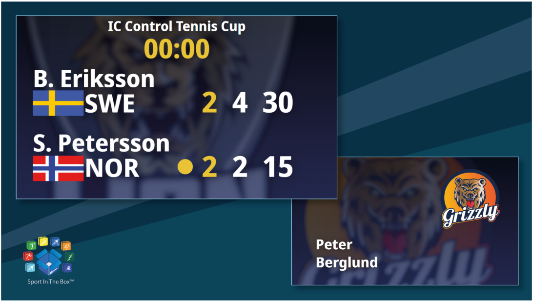
Table Tennis Scoreboard template pack includes the following templates:

Josefin Ström - 2023-10-03 - Kommentarer (0) - Table Tennis