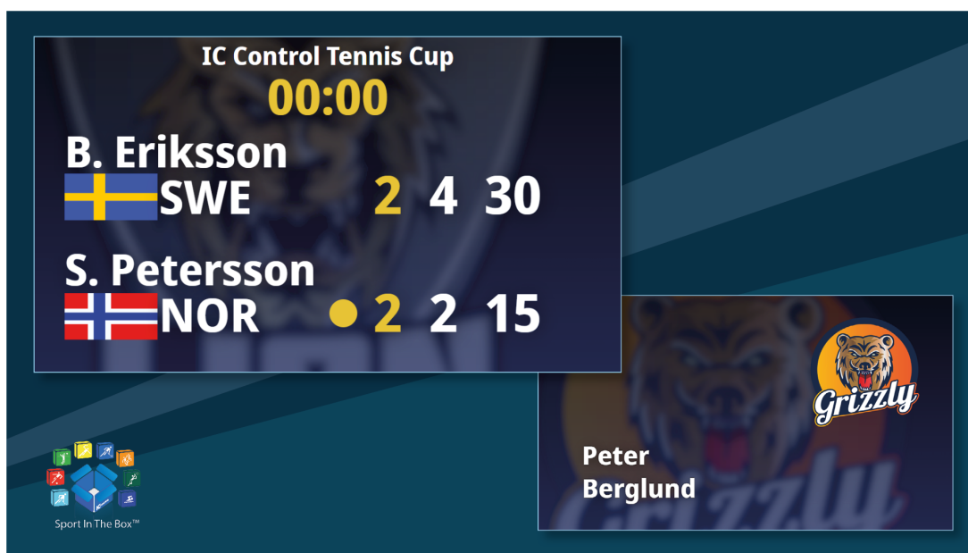
Table Tennis Scoreboard template pack includes the following templates:

Josefin Ström - 2023-10-03 - Comments (0) - Table Tennis